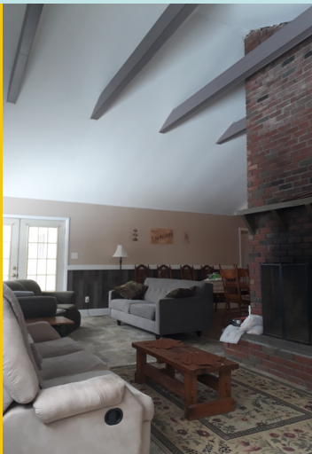
Phase 1 Building 50 99% complete